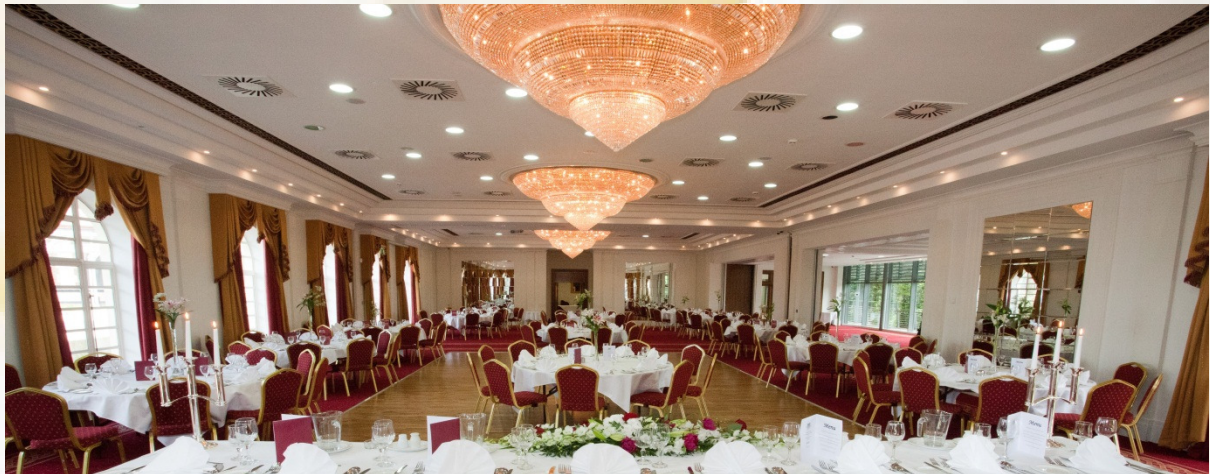
The Boyne Suite

We also offer complimentary secure off street parking for all your guests.